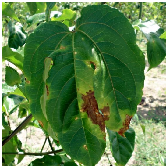
Figure 1. Symptom of bacterial blight in a leaf of passion fruit, caused by Xanthomonas axonopodis pv. passiflorae

(Figure 1). Whereas in the fruits, the spots are large, initially greenish and oily, then brown, generally circular and well delimited. 5