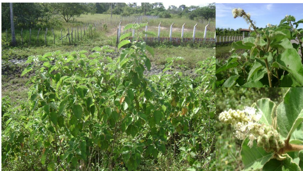
Figure 1. C. piauhiensis